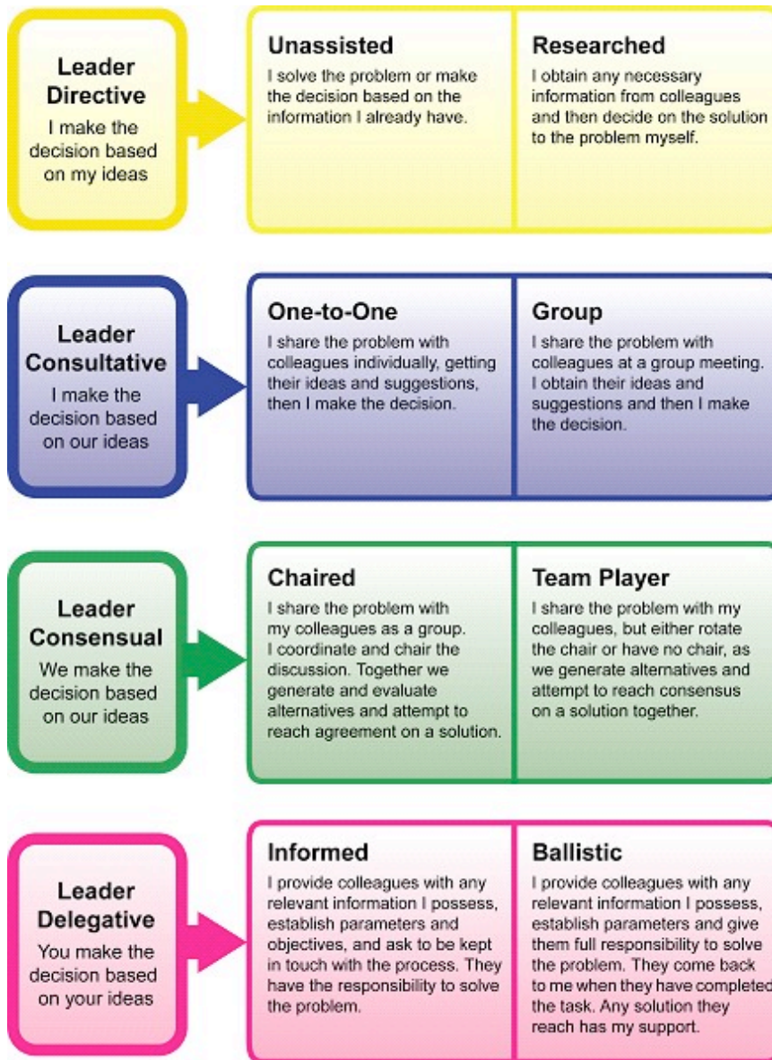
Figure 1 - The Model of Leadership Decision Making Styles underpinning the LG-LJI.

No one leadership style is universally applicable or inherently better than any other. Effective leaders adapt their style to the nature of the task and the characteristics of the people involved, guided by the Principles described in the Appendix.